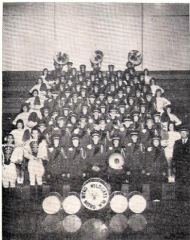
NITRO HIGH SCHOOL BAND